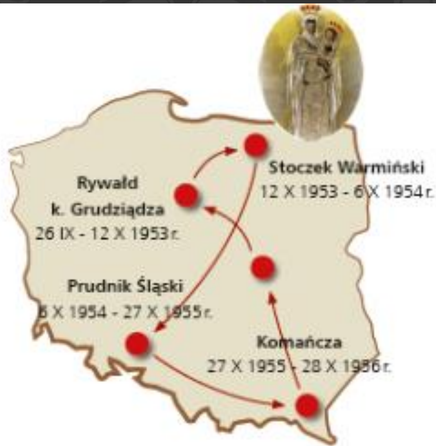
Miejsca internowania Prymasa Stefana Wyszyńskiego