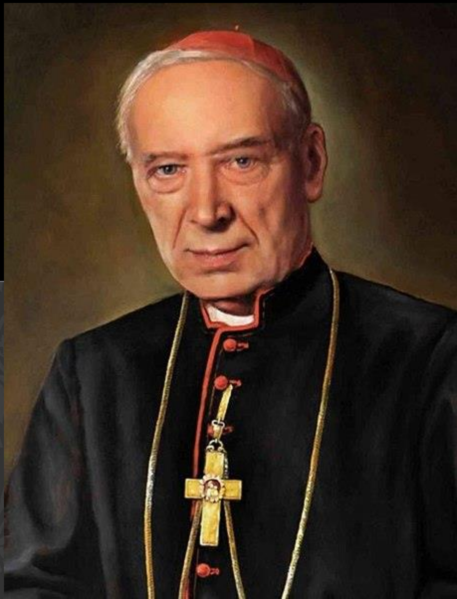
Cardinal Stefan Wyszyński